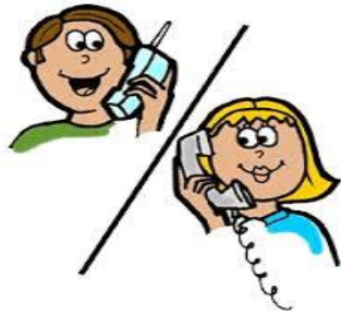
Call a Friend