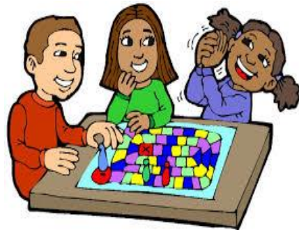
Play a Game