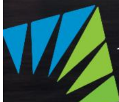
Tourism London