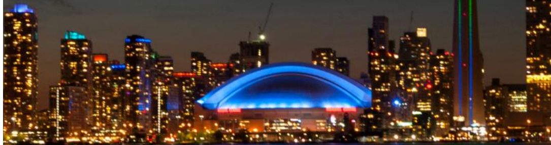
Toronto Skyline

Getting involved is easy and the impact will be illuminated in communities across Ontario.